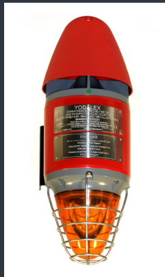
YL6 Combination Unit

The Most Compact Explosion Proof Horns, Strobes and Combination Units