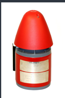
YO6 Omni Directional Horn