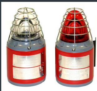
V6 Xenon Strobe